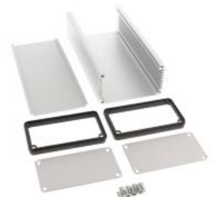
Many models feature a slide-