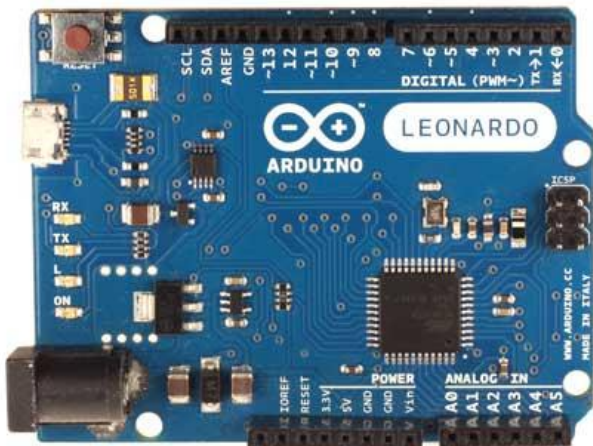
Arduino Leonardo Front with headers