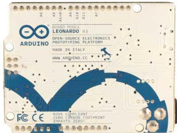
Arduino Leonardo Rear