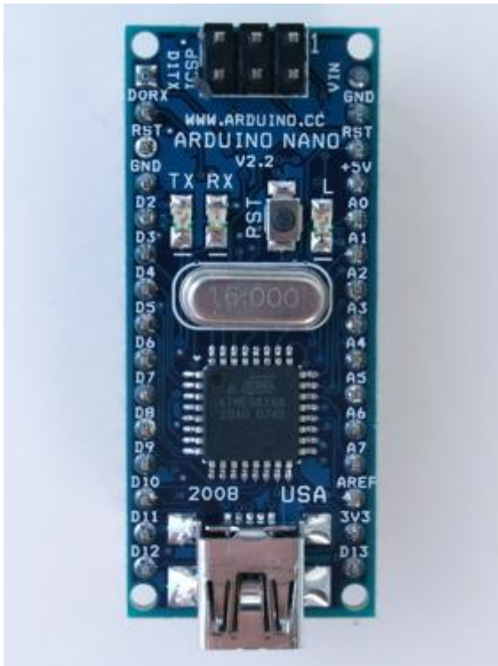
Arduino Nano Front