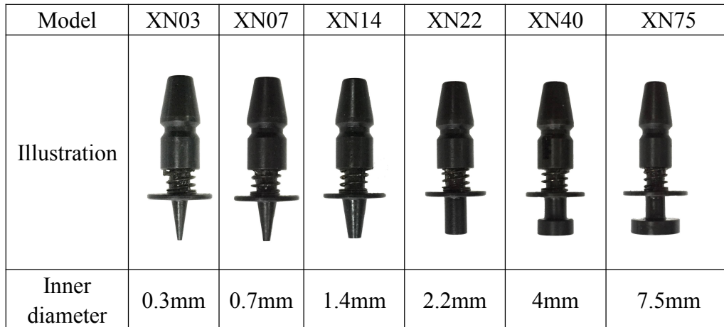
Table 1-1 Nozzle

Please choose nozzles according to the shape and size of components.