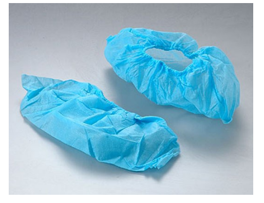
Art. CLEAN COVERSHOES CPE Polyethilene covershoes

Art. HOOK ESD COVERSHOES Polypropilene elasticated ESD covershoes with conductive strip and hooks for dispenser box