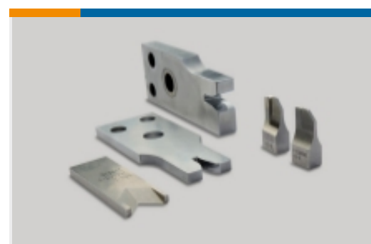
Spare & Wear Tooling(2)