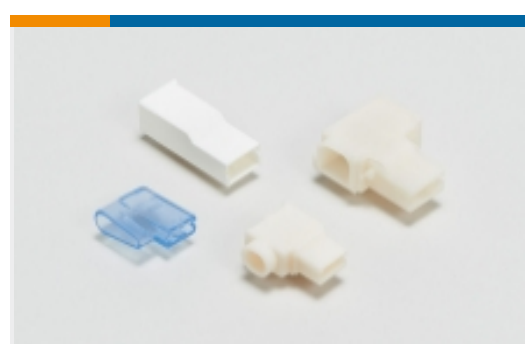
Crimp Terminal Housings (222)