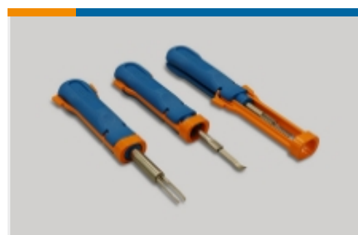
Insertion & Extraction Tools (2)