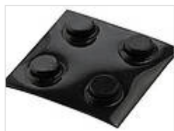
Rubber feet, self-adhesive