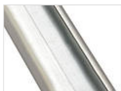
DIN rail acc. to DIN EN 60715 G 32

For EM/ET 213, EM/ET 215-217, EM/ET 227, B 1408., B 1413..