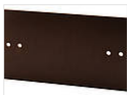
Mounting plates, laminated paper (Pertinax), galvanised steel for version 260

For EM/ET 213, EM/ET 215-217, EM/ET 227, B 1408., B 1413..