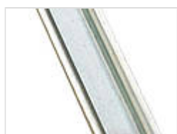
DIN rail acc. to DIN EN 60715 TH 15