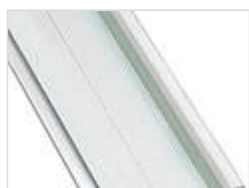
DIN rail acc. to DIN EN 60715 TH 35

For EM/ET 213, EM/ET 215-217, EM/ET 227, B 1408., B 1413..