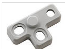
Wall brackets, screw-on at rear