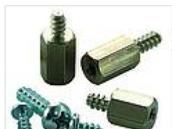
Screws (SHR) and distance bolts (DIBLZ) for mounting bosses in plastic enclosures

For EM/ET 215, M/T 215-216, M/T 226, M/T 230