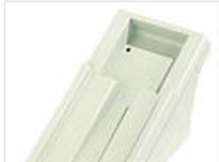
Table stand BOS 900-903 / BOS 910-913