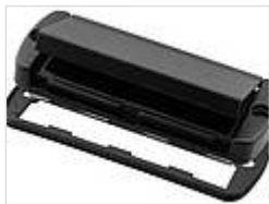
Mounting lid with hinged aluminium flap