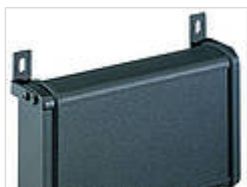
Wall brackets, sheet steel