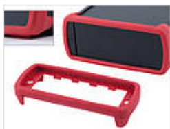
Impact protection seals, fire red