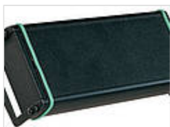
Wall brackets, adjustable, sheet steel