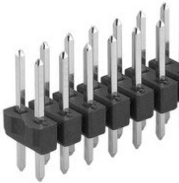
PCB connectors > Male headers two rows, □ 0.635 mm