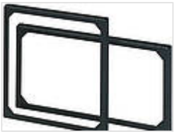
Front frame with screw covers, snaps firmly on