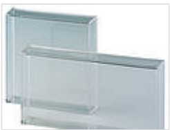
Crystal-clear hood, snap-on, polycarbonate