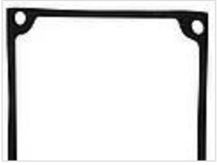
Front panel seal (non-definable protection class)