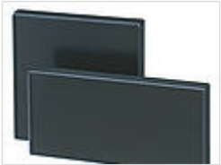
Front lid with continuous membrane keypad, snaps firmly on