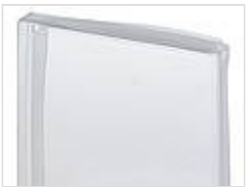
Clear hood cover, flexible, up to IP 65 possible