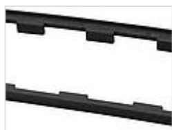
Seals UL 94 V0