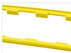
Seals, rape yellow