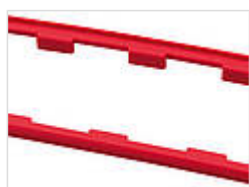
Seals, fire red