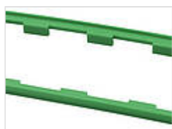
Seals, patina green