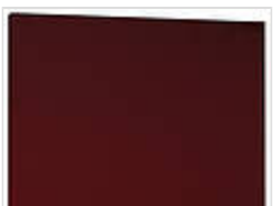
Plastic front panel, red translucent, 3 mm

37000950 NGS 98 FKT For NGS 98.., for NGS 9806-GR