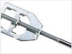
Screw clamp for screw-fitting enclosure