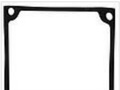
Front panel seal (non-definable protection class)

37098010 NGS 98 DI For NGS 98.., for NGS 9806-GR