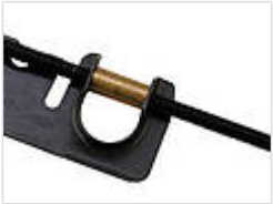
Standard retaining clasp in accordance with DIN 43835 form B (only for use with NGS-ZE)