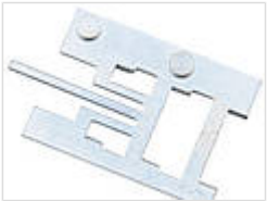
Connecting piece for insertion of standard retaining clasps acc. to DIN 43835