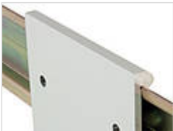
Metal top hat rail adapter for DIN rail DIN EN 60715 TH 35