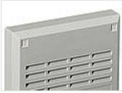
Screw cover, ABS