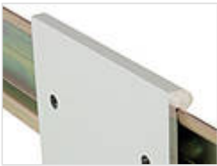
Metal top hat rail adapter for DIN rail DIN EN 60715 TH 35