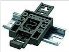
Universal DIN rail holder TSH 35, polyamide