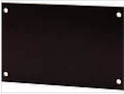
Mounting panel, laminated paper