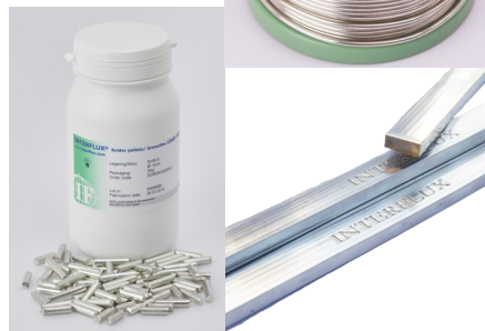
Products pictured may differ from the product delivered

Sn99Q is an alloy intended for rework of LMPA-Q solder joints in form of a solder wire. It is also available as an alloy in