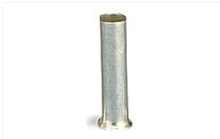
Color: ■ silver-colored