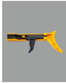
0302 紫線槍 TIE GUN TG-6 適用紫線帶寬度: 2.5 ~ 5.0 mm