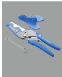
0302 線槽剪 WIRING DUCT CUTTER WT-2 適用於各式PVC配線槽、浪管、水管等裁剪。 可調整需要裁剪的角度。