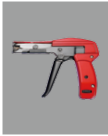
0302 紫線槍 TIE GUN TG-3 適用紫線帶寬度: 2.2 ~ 4.8 mm