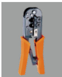
1530 網路線接頭壓著鉗 MODULAR CONNECTOR CRIMPING TOOL YTT-06 適用接頭: 8P8C / 6P6C