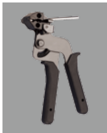
0302 不鏽鋼紫線槍 TIE GUN TG-21 適用紫線帶寬度: 4.6 ~ 7.9 mm