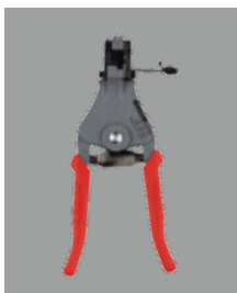
1530 剝線鉗(日製) WIRE STRIPPER WS3000A 0.5/1.2/1.6/2.0mm 2 AWG 24/ 16/ 14/ 12 WS3000B 1.0/1.6/2.0/2.6/3.2mm 2 AWG 18/ 14/ 12/ 10/ 8 WS3000C 0.9/1.25/2.0/3.5/5.5mm 2 AWG 17/ 16/ 14/ 12/ 10