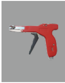
0302 紫線槍 TIE GUN TG-5 適用紫線帶寬度: 2.2 ~ 4.8 mm