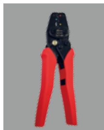
1530 省力型壓著絕緣端子鉗 CRIMPING TOOL DLT-6H 適用端子: sq 1.25, 2, 5.5 mm 2 DIN 1.5, 2.5, 6 mm 2