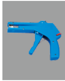
0302 紫線槍 TIE GUN TG-7 適用紫線帶寬度: 2.5 ~ 5.0 mm