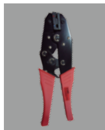
1530 旗型附絕緣端子壓著鉗 HAND CRIMPING TOOL FOR INSULATED FLAG DISCONNECT LY03-FL 適用端子: 0.5-2.5 mm 2