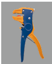
1530 自動調整切斷剝皮鉗 SELF-ADJUSTING CUTTER-STRIPPER KTY-318 (0.5-8.0 mm 2 ) 最大剝線長度 25mm