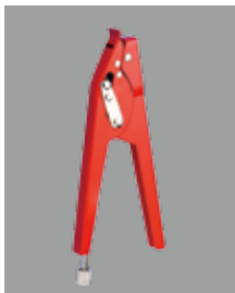
0302 紫線槍 TIE GUN TG-10 適用紫線帶寬度: 4.8 ~ 13.0 mm