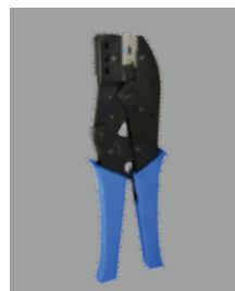
1530 旗型附絕緣端子壓著鉗 HAND CRIMPING TOOL FOR INSULATED TERMINALS AND FLAG DISCONNECT YS-03FC 適用端子: 藍:2sq & FL1.25-7A