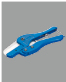
0302 線槽剪 WIRING DUCT CUTTER WT-1 適用於PVC配線槽裁剪