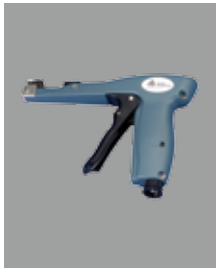
0302 紫線槍 TIE GUN TG-1A 適用紫線帶寬度: 2.2 ~ 7.0 mm (Dennison)