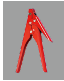
0302 紫線槍 TIE GUN TG-9 適用紫線帶寬度: 2.5 ~ 10.0 mm