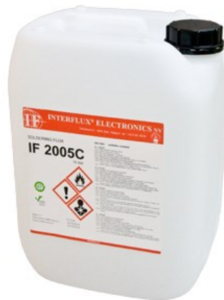
Products pictured may differ from the product delivered

The flux is classified as OR/L0 according to EN and IPC standards.