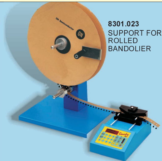
8301.023 SUPPORT FOR ROLLED BANDOLIER

8301.028 rotating SMD supports and 8301.030 SMD bandolier handle are optional items.