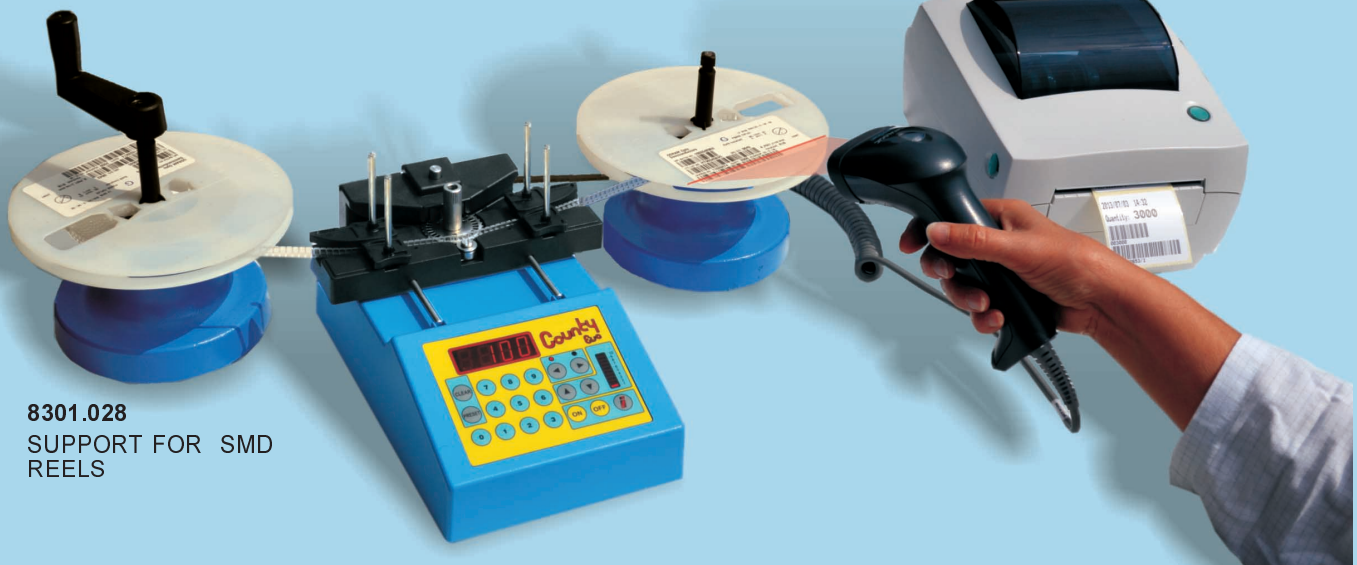
8301.028 SUPPORT FOR SMD REELS