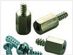
Screws (SHR) and distance bolts (DIBLZ) for mounting bosses in plastic enclosures

For M/T 210-215, M/T 217, M/T 220-227, M/T 231