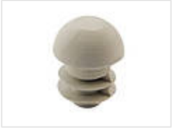
Rubber feet, plug-in