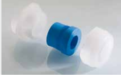
Abb. 2 Fig. 2

PVDF, Farbe: transparent, blau (RAL 5015), schwarz (RAL 9005) Metrisches Anschlussgewinde EN 60423 Schutzart IP 68 bis 10 bar