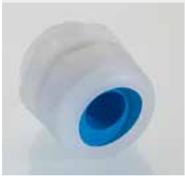
Abb. 1 Fig. 1