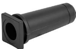
Cable Guard KT14 PVC Cable Guard for rewireable connectors